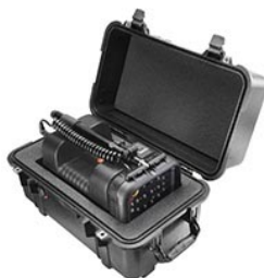
1460AALG 1460 Case with custom fit foam

Pelican 23215 Early Ave • Torrance, CA 90505 USA • Phone: (310) 326-4700 • (800) 473-5422 • Fax: (310) 326-3311 sales@pelican.com • www.pelican.com